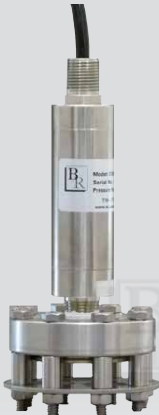
Model BC001 Birdcage®