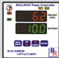
Replaces Previous Model BD100