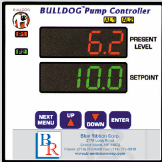
Model BD100 Set Point Pump Controller

The BD100 controller is an easy and inexpensive solution for monitoring and controlling pump station water levels. With six programmable level set points for pump control, including on/off set points for two pumps and settings for two alarms, and a preprogrammed set of default parameters to simplify the user interface and set-up.