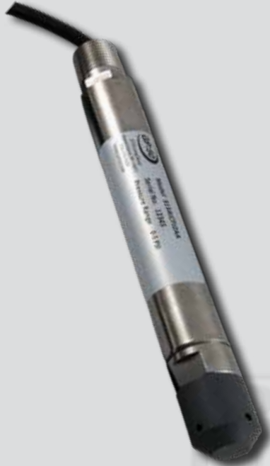
Model 313AI Submersible Level Transmitter for Hazardous Locations