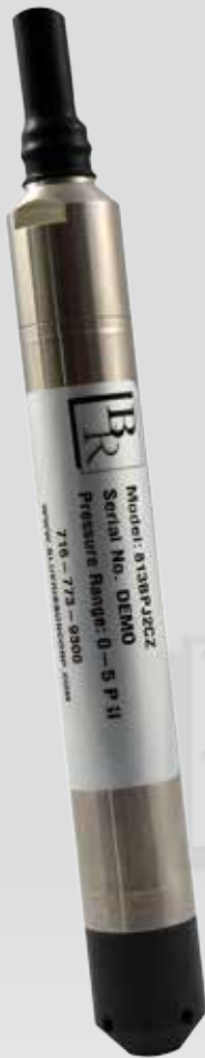
Model BR913 Serial/Digital Interface Submersible Level Transmitter