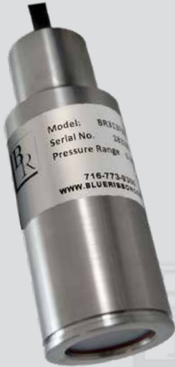
Model BR313F Flush Submersible Level Transmitter