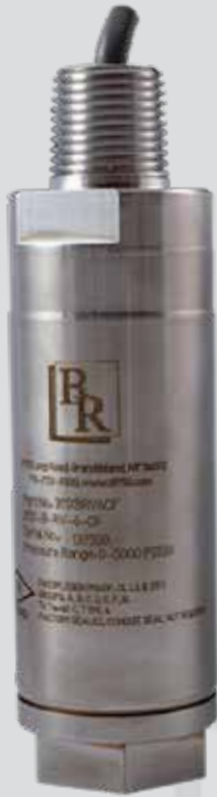
Models 111X/P, 211X/P, 311X/P & 311N/AN/GN Explosion Proof & Zone 2/Div 2 Pressure Transmitter