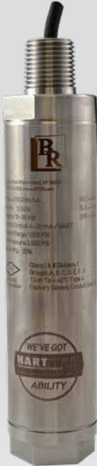
Model BR411, 411XP Smart Rangeable Pressure Transmitter