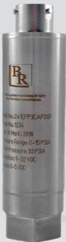
Model BR241 / 341 High-Accuracy Pressure Transducer