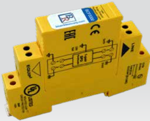
Model BCP3000 Birdcage® Series Surge Protector