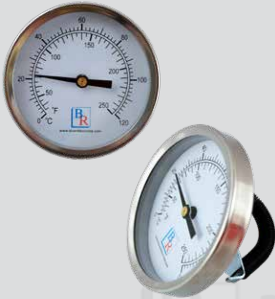
Model BRCT Clamp-On Thermometer