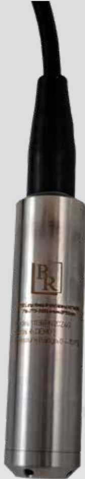
Model BR1112/1113 Submersible Level Transmitter with Sludge Nose