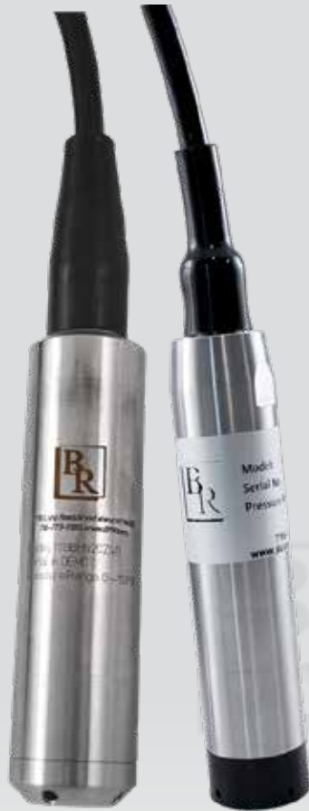
Model BR1112/1113 Submersible Level Transmitter with Sludge Nose