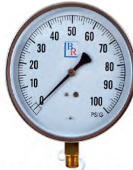
*MODEL BR601D Contractor Gauge Series