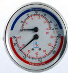
MODEL BRPT Boiler Gauge/Tridicator