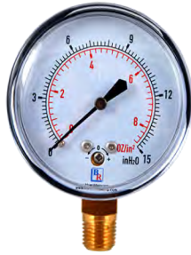
*MODEL BR500D Low Pressure Diaphragm Gauge