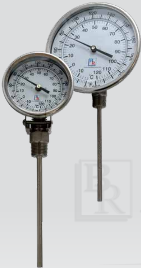
Model BR3A and BR5A Bi-Metal Thermometer Adjustable Angle Type