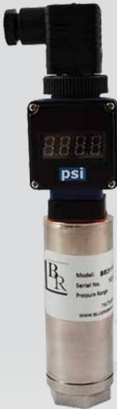
Model LD1001 Loop Powered Local Indicator

* Includes internal push buttons to manually adjust zero and span, as well as decimal placement and relay set points.