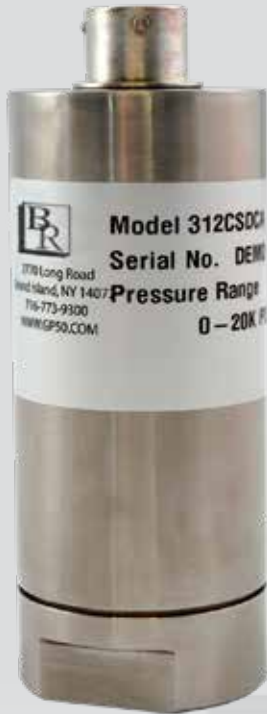
Model BR112 / 212 / 312 Ultra High-Pressure Transducer