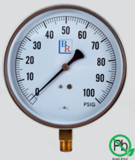
Model BR601D Contractor Gauge Series

The Model BR601D from Blue Ribbon Corporation is a family of durable contractor pressure gauges, designed to meet the needs of contractors involved in HVAC, plumbing, and industrial and commercial refrigeration applications. Quality and affordability make this series the most attractive gauge for any project where bronze internals are suitable for use.