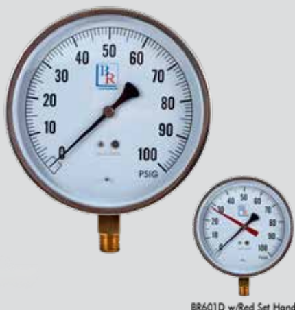
BR601D w/Red Set Hand

The Model BR601D from Blue Ribbon Corporation is a family of durable contractor pressure gauges, designed to meet the needs of contractors involved in HVAC, plumbing, and industrial and commercial refrigeration applications. Quality and affordability make this series the most attractive gauge for any project where bronze internals are suitable for use.